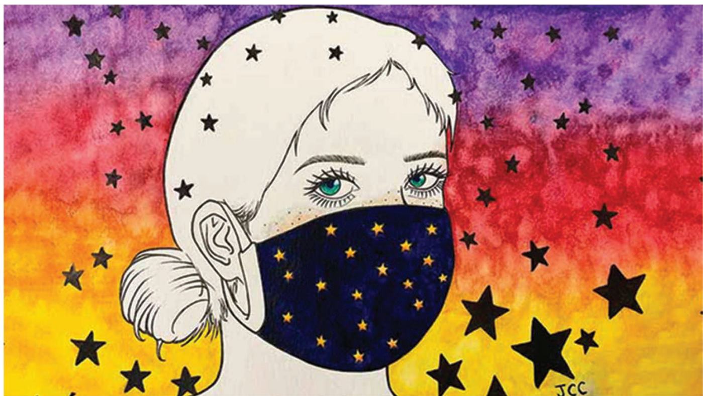
"Current Events" by Jesse Cooke (student), mixed media

The Nursing program continues to have a strong pass rate for its graduates on the National Council Licensure Examination (NCLEX), required to attain their registered nursing license. Cecil College's Nursing program has been consistently among the highest performing schools in Maryland and for the past two years (2018 and 2019), was the only institution in the State of Maryland to have a perfect pass rate of 100%. Cecil College not only often exceeds the pass rate for most of the 14 community colleges in Maryland, but also for many of the 12 four-year universities offering a Bachelors or pre-licensure Master of Science degrees in nursing.